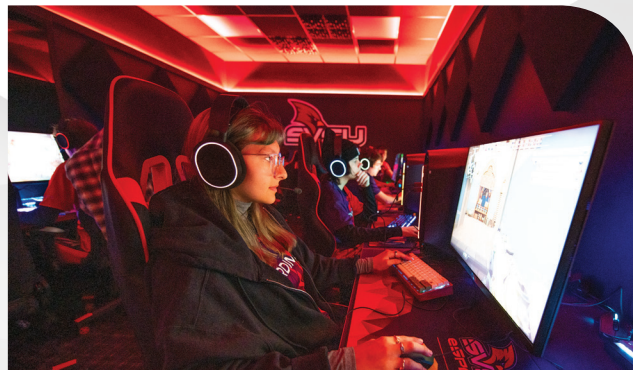
SVSU Esports club team's 2025 major competitions include the Smash Ultimate Open ($5K prize pool), Collegiate Rocket League Invitational ($10K prize pool), Mario Kart World Open and the Youth Fortnite Battle Royale Tournament (scholarships & prizes).