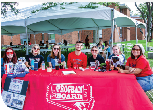
The Program Board is a student-run organization providing free events on campus to all students!