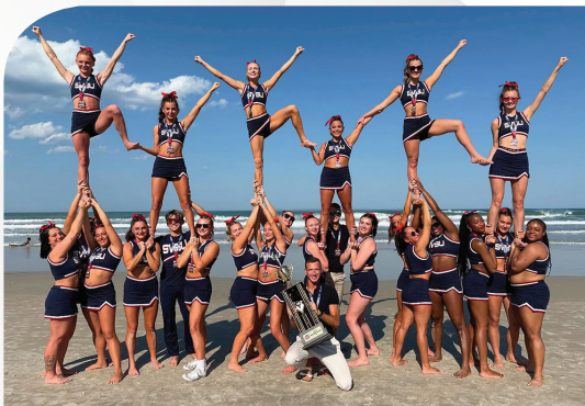
The SVSU club cheer team made school history by capturing second place in the D2 Intermediate Small Coed Division at the 2025 NCA College Nationals, stepping up from their third-place finish in the same category in 2024.