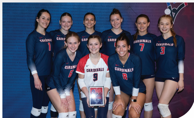
The SVSU women's club volleyball team competed at the National Collegiate Volleyball Federation (NCVF) national tournament in April 2025.