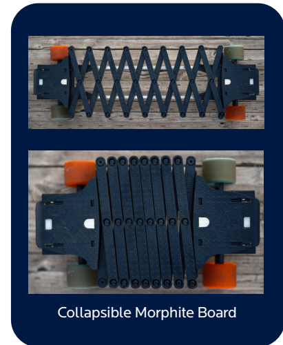
Collapsible Morphite Board