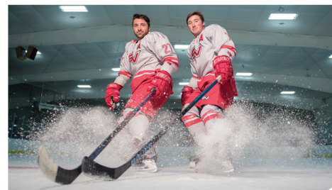
Saginaw Valley club hockey players compete in the American Collegiate Hockey Association and prepare for competitions throughout the year at the nearby Saginaw Bay Ice Arena.