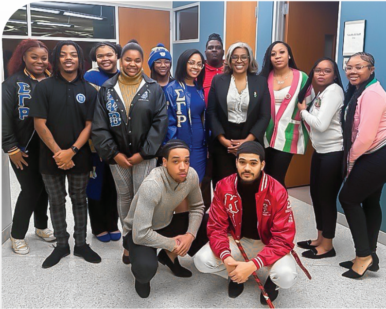
SVSU has 16 different Greek Life organizations. Shown here, Divine 9.